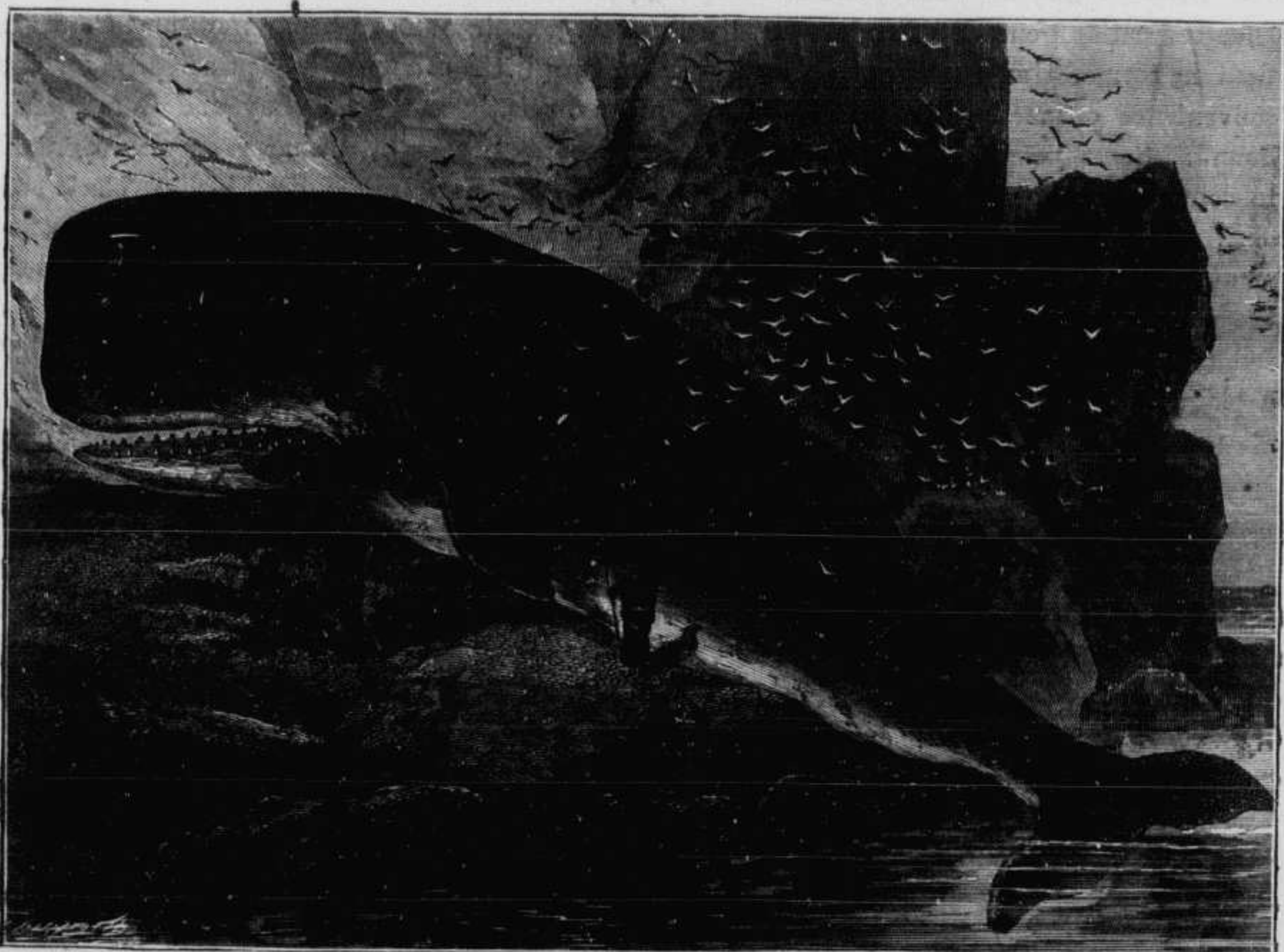
A STRANDED SPERMACEI WHALE. ( Cetodon macrocephalus .)

"Prone on the food extended, long and large" "floating many a hood; in bulk as huge" "As whom the fishes range of monstrous size."