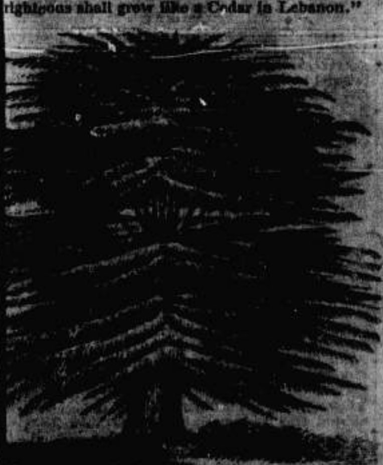
THE PALM TREE OF LEBANON. Of the culture of Lebanon, of Protection, of B... ... the Palm Tree, shall have pe... ... in Lebanon, were a single nation, and ... of Lebanon, and it follows ... the year, the year, the year, the year ... will be.